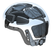
Comfort Layer Option